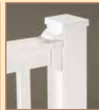
Series 200 Add real architectural appeal with the strong lines of the T-Rail system