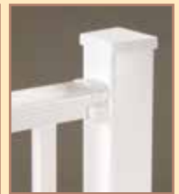
Series 300 Soft curves of the Small Contour Rail work to conceal the amazing strength inside