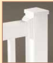
Series 100 2" x 3.5" railing is contemporary and straightforward

The Enrail vinyl railing system is engineered for a higher standard of living, so you can trust your rail for a lifetime of performance and good looks. Enrail is more than just durable, sturdy and safe. You receive the perfect complement to your home's architectural style with ultimate flexibility of design options. Enrail vinyl railing also meets or exceeds stringent AC10 and AC174 standards, and is CCRR-0107 code approved. Available in three handrail styles (at right).